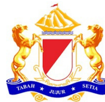
Kamar Dagang dan Industri Indonesia