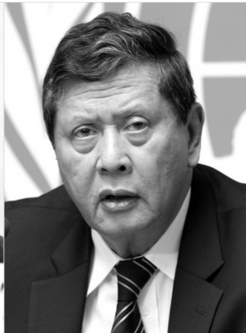
Marzuki Darusman Attorney General (1999-2001), Deputy Chair of National Commission on Human Rights (1993-1998), Special Rapporteur in United Nations