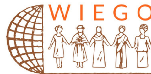
Women in Informal Employment: Globalizing and Organizing